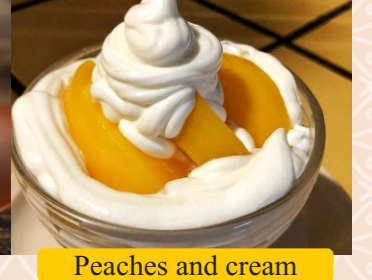
Peaches and cream

“These photos are merely illustrative, the presentation of food may vary”