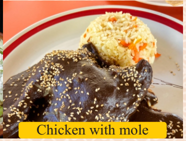
Chicken with mole