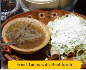
Fried Tacos with Beef broth